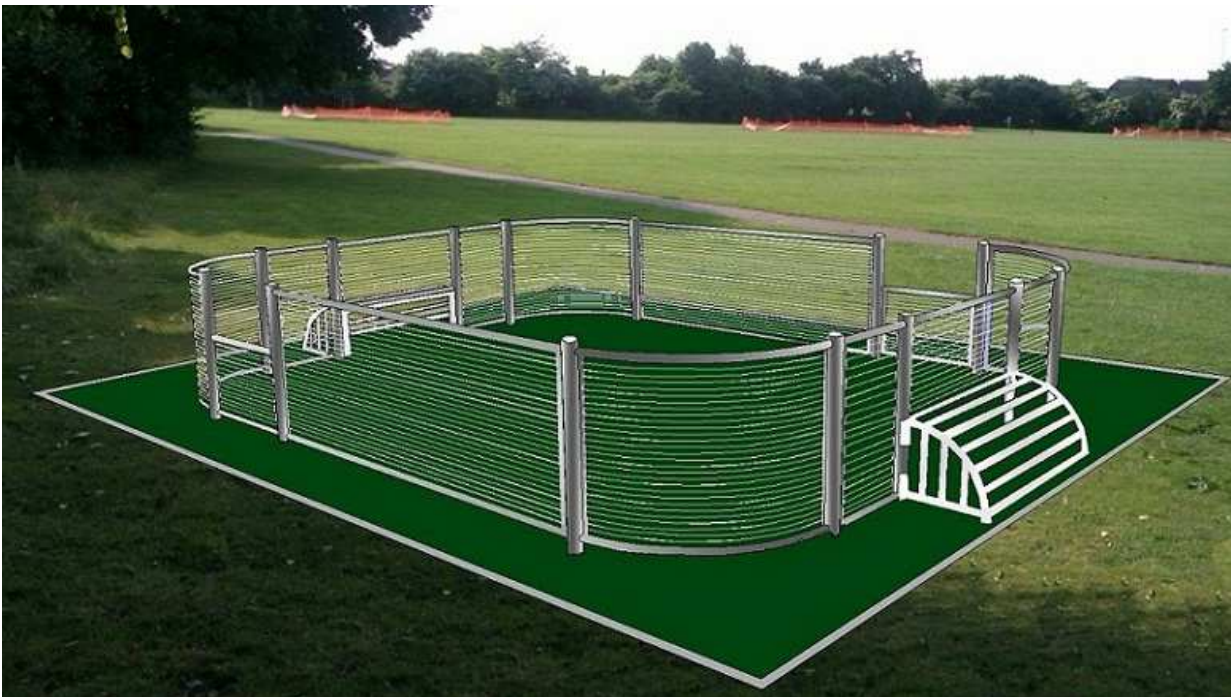
Panna within currently proposed location